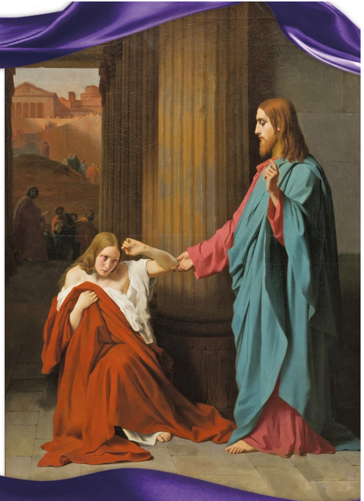
Christ and the Woman Taken In Adultery by Emile Signol Circa 1842